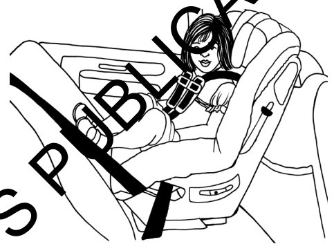
Convertible seat , for a child up to 30 to 50 pounds when facing the rear (check label).