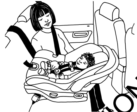
Rear-facing-only seat , for a child up to 22 to 35 pounds (check label).